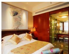
GuiBin Suite (Five star room) 880 RMB/night

The local organizer will help with the room reservation. Please fill out the hotel reservation form and return it to Ms. HUANG Yiting ( huangyiting@mail.iap.ac.cn ) by email preferably by 15 April 2012 . See below for rooms and rates that are available. All the room rates include breakfast and free internet access. Late reservations will be subject to availability of rooms. Please note that each participant is responsible for his/her own hotel payment; a credit card is needed when checking in.