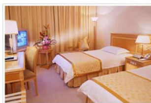
YiBin Standard Room (Four star room) 518 RMB/night