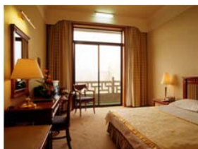
JingBin Standard Room (Four star room) 458 RMB/night